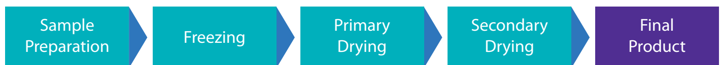
Figure 1: An overview of the lyophilization process

A critical step in the fill-finish manufacturing process, lyophilization removes water from the product after it has been frozen. Modern lyophilization systems utilize an inert gas and pressurization and rapid depressurization to create instantaneous ice nucleation throughout the product, massively improving heterogeneity, and therefore quality. During drying, the chamber is placed under a vacuum, allowing the ice to change directly from a solid to a vapor without passing through a liquid phase. Process control during freeze-drying is imperative to the product integrity.